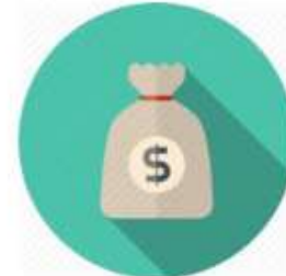
Conto corrente Bank account