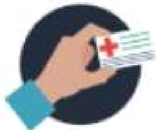
Assicurazione sanitaria Health Insurance