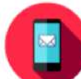
Help Desk Induction