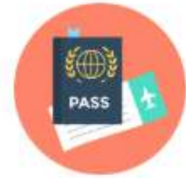
Procedure di immigrazione Immigration procedures